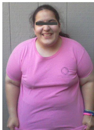
Figure 1. A female adolescent with FXS Prader-Willi-like phenotype.

The physical phenotype and dysmorphology of FXS include signs of a connective tissue disorder such as a long and narrow face, large and prominent ears, a high arched palate, hyperextensible finger joints, pectus excavatum, flat feet, soft skin and mitral valve prolapse. Other features include low muscle tone, and pubertal macroorchidism (31,32). Noteworthy approximately 30% of young children with FXS will not have obvious dysmorphic features; the physical features are associated with the FMRP deficits. The most evident effects of lower levels of FMRP in both males and females are prominent ears and hypermobility of the metacarpal-phalangeal (MP) joints (33,34). In males FMRP deficits are associated with a narrow face and large ears, while in females the FMRP deficits are associated with increased ear prominence and jaw length (35). In about 5-10% of children with FXS a Prader-Willi phenotype is observed including severe obesity, hyperphagia, hypogonadism and in some cases delayed puberty (36,37) (Figure 1). The reduced expression of the cytoplasmic interacting FMR1 protein