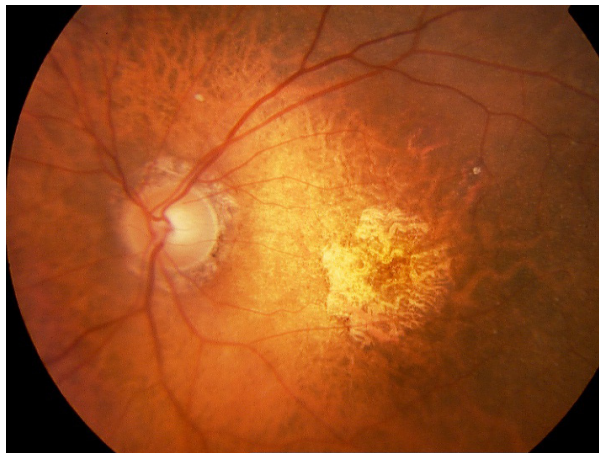
Figure 2. Fundus photograph showing geographic atrophy due to age-related macular degeneration.

in over 50% of patients, as reviewed (7). It represents the slower and more insidious form of the disease, and accounts for approximately 20-25% of patients with severe visual loss secondary to AMD (legal blindness related to AMD) (8) and for a much larger percentage of moderate visual loss of the elderly (9).