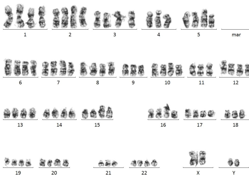
Figure 1. Karyogram of tetraploid subclone of acute promyelocytic leukemia cells.