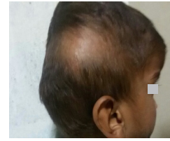
Figure 2. A patch of alopecia present above both ears.