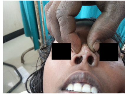
Figure 4. Another picture of patient after treatment showing roomy nasal cavity.