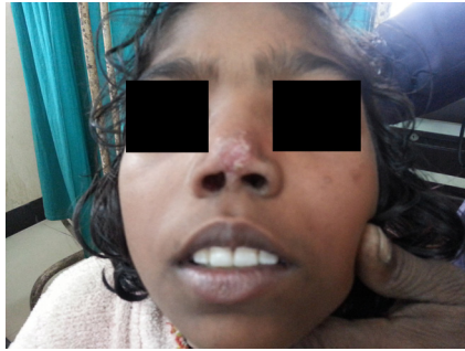
Figure 3. Picture of patient after treatment showing resolution of ulceration & crusting.