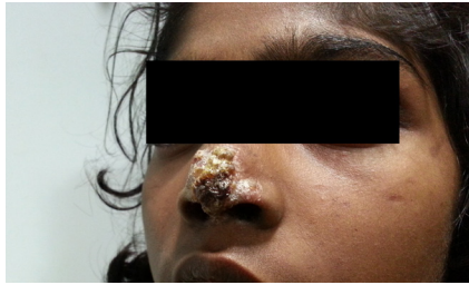
Figure 1. Picture of patient before treatment showing ulcerative & crusted lesion over Tip of nose.