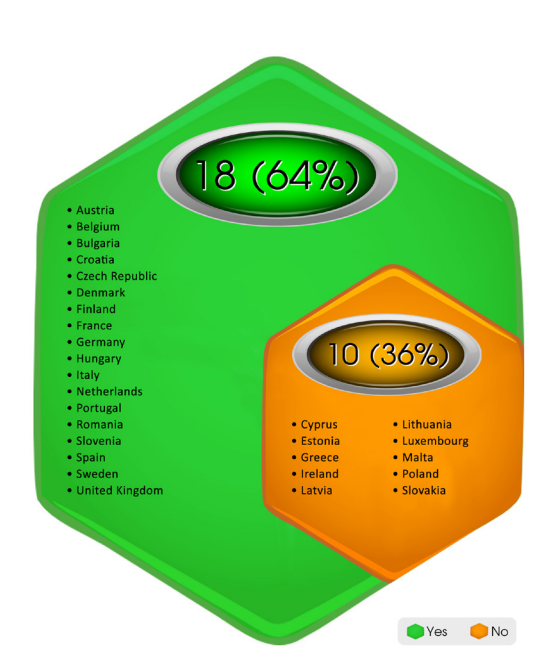
Figure 3. Presence of regulations and well-defined processes in the European Union member states. This chart shows that 18 countries of the European Union member states have legislation and a well-defined process in place for Compassionate use program and the rest do not.

CUP in EU5: France has an elaborate scheme for CUP called Temporary Authorizations for Use (ATU). It allows the exceptional use of medicinal products