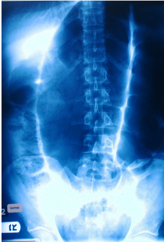
Figure 1. Classic coffee-bean sign on plain abdominal radiograph in Case No. 1.

roentgenography revealed a classic sign of sigmoid volvulus (coffee-bean sign) (3) (Figure 1). The man's WBC count was 18,000/\text{mm}^3 ( 4-11 \text{ mm}^3 ) with a neutrophil percentage 80%. Serum electrolytes were: sodium 130 mmol/L (134-145 mmol/L), potassium 3.0 mmol/L (3-5 mmol/L), urea 5.5 mmol/L (2.9-9.3 mmol/L), and creatinine 110 micromol/L (80-115 micromol/L). Detorsion was attempted endoscopically but unsuccessful. A laparotomy was performed, revealing sigmoid volvulus.